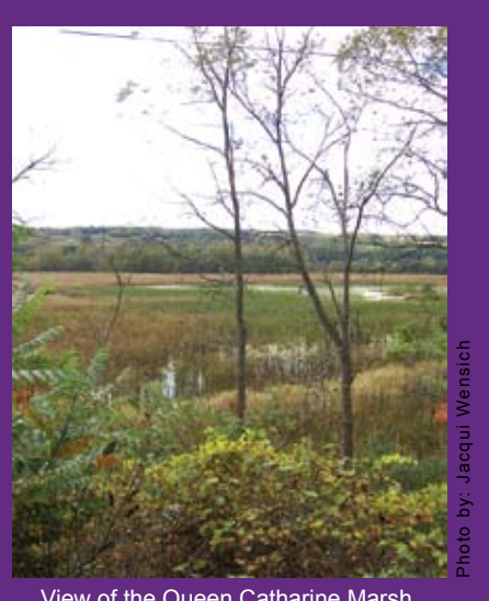
View of the Queen Catharine Marsh from Rock Cabin Road.

seasons. Roadside stands of Hackberry trees attract the three unusual butterfly species - Tawny Emperor, Hackberry and Snout. Also, proximity to the Queen Catharine Marsh makes this road an outstanding bird watching area.